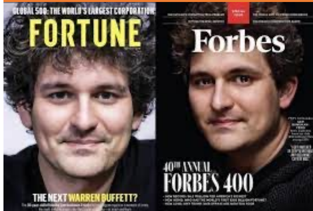
Fortune Forbes Magazines